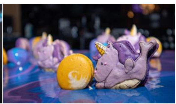
The new NOC mascot, named "Whallycorn", created by NOC alumna Khor Ke Xin