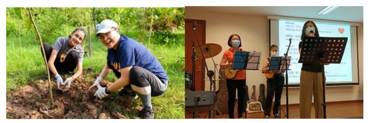
Planting of 60 trees to establish a coastal forest at Kranji Coastal Nature Park

NUS Cares, the University's year-round initiative to engage and serve the community, made an impact in diverse fields this year. From promoting environmental sustainability by planting trees to befriending seniors and disadvantaged children, close to 400 students, staff and alumni proudly upheld NUS' tradition of service to society.